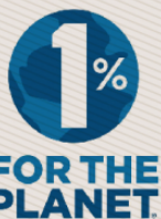
Member of 1% FOR THE PLANET