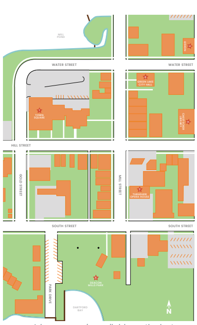
A larger map is available on the last page

City Hall - Art Exhibit Only 534 Mill St.